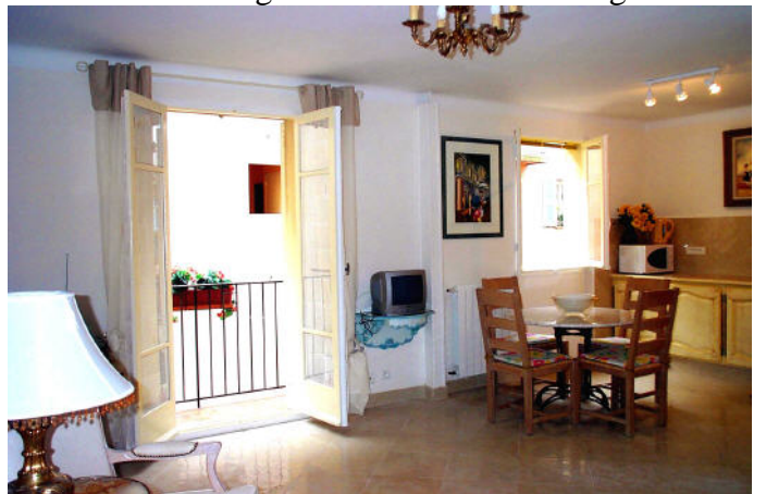
Looking towards balcony and dining area