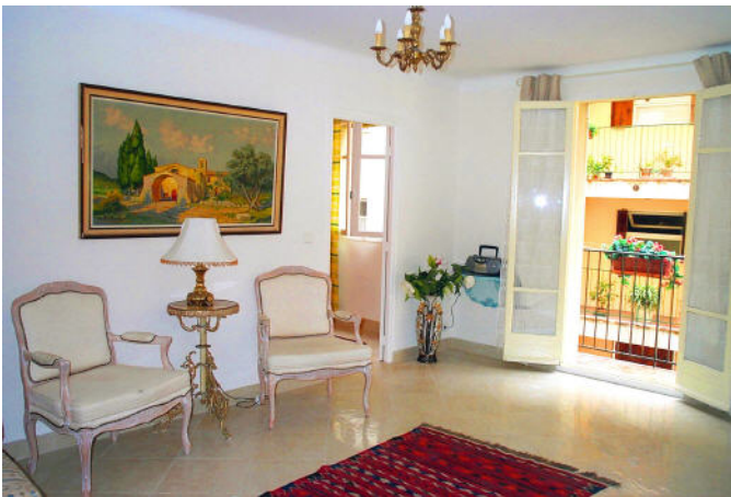
Looking towards the balcony and bedroom