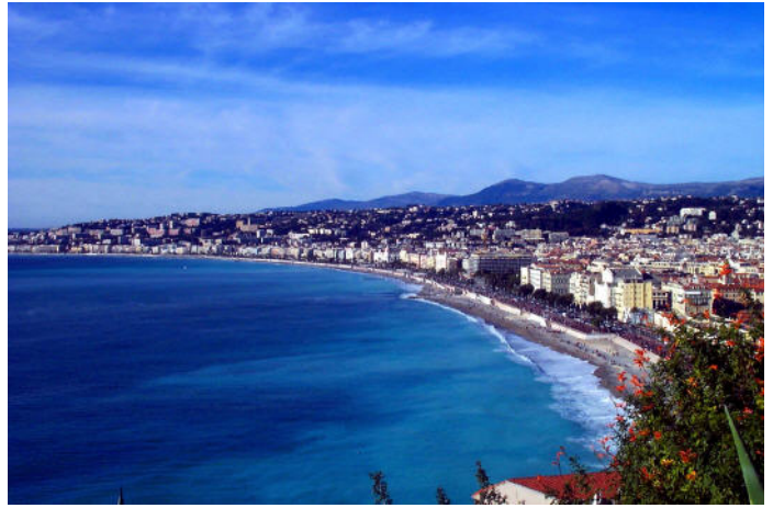
Baie des Anges & Promenade des Anglais