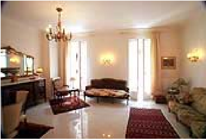
Lounge – Dining Room