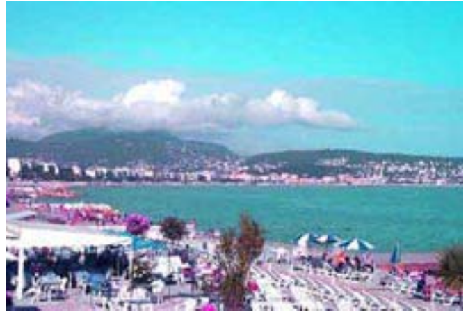
Promenade des Anglais, Mediterrean and Beach