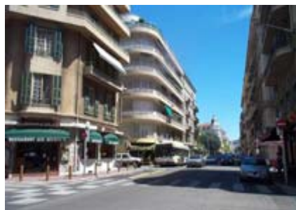
Rue Dante – 200m from Promenade des Anglais