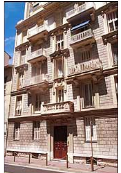
La Belle Epoque building