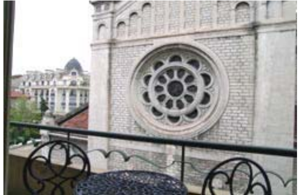
View from lounge balcony