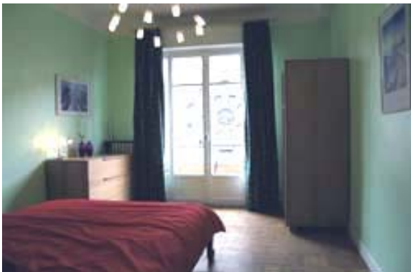
Bedroom 1 – view towards window