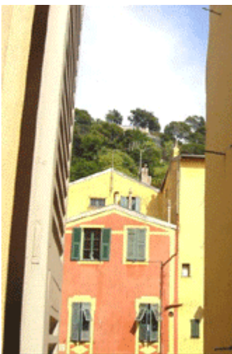
View of the Chateau Hill looking left from each bedroom window