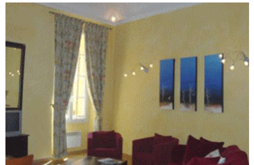
Lounge, looking from the doorway