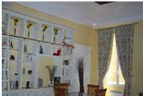
Dining area in the lounge