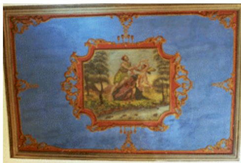
Fresco painting on the ceiling in the lounge. It is estimated to have been painted around 1750