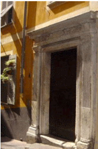
Majestic front door to the apartment building